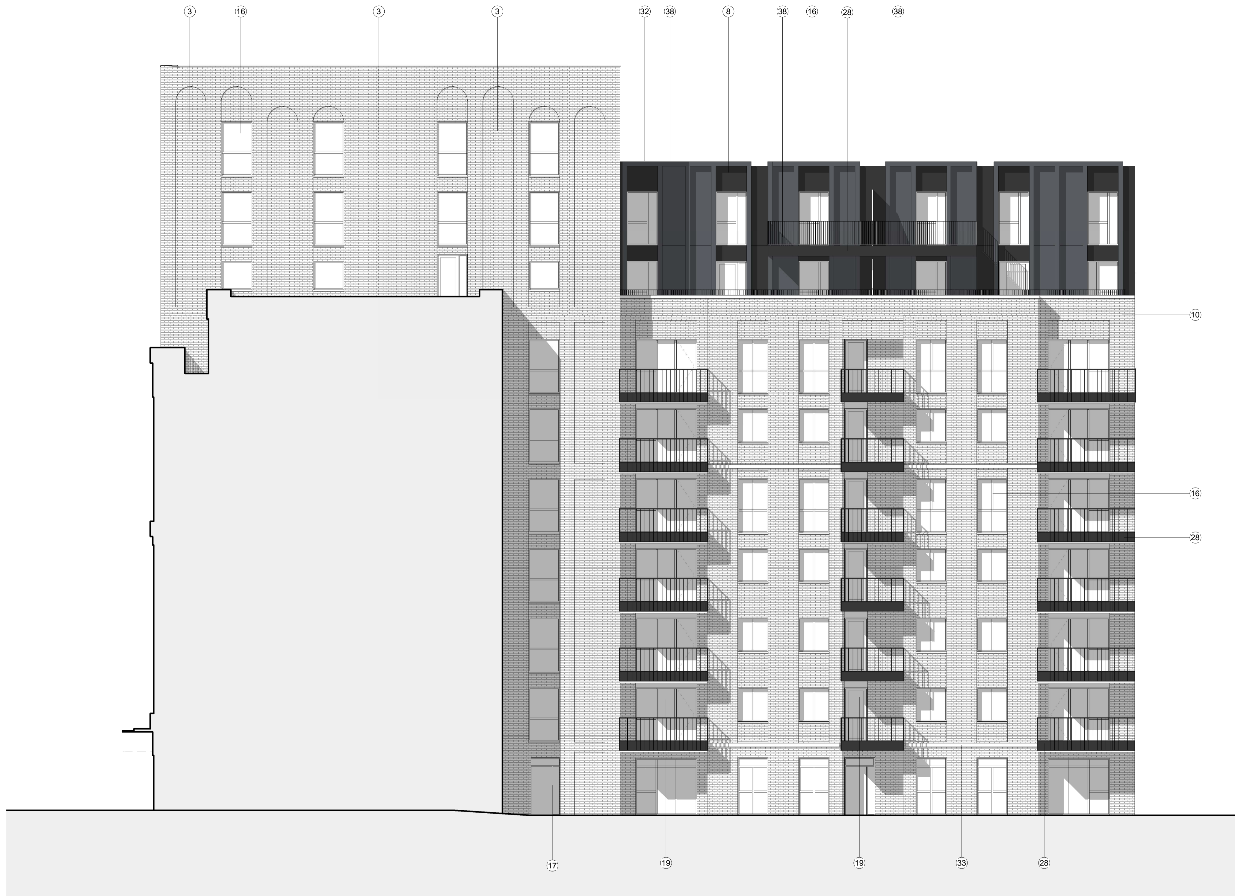
Block A East Elevation 1 : 100